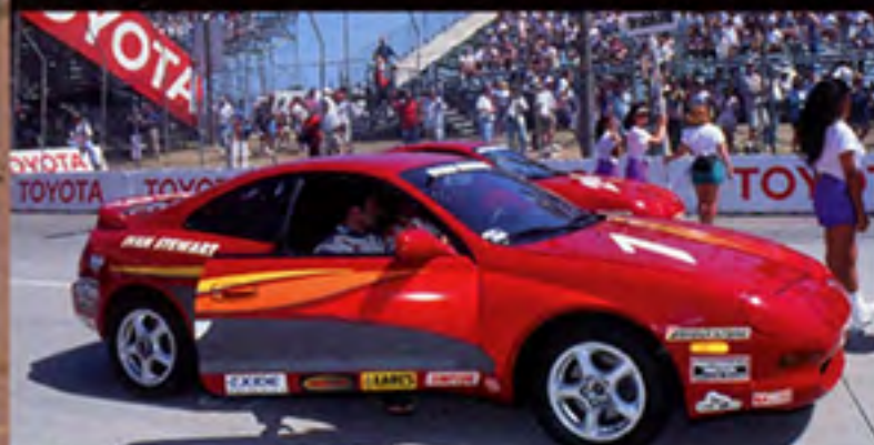
The Toyota Celica "Celebrity Race" Fleet

As Toyota's Motorsports partner, PPI is also responsible for operating: