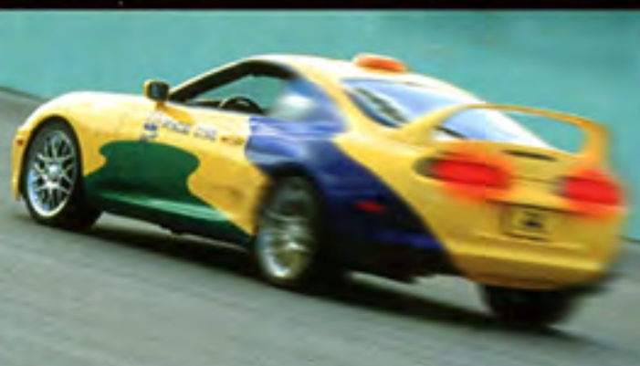
All Toyota Pace Cars and Trucks