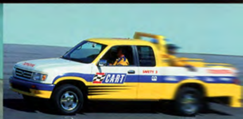
The CART INDY CAR Toyota Safety Trucks